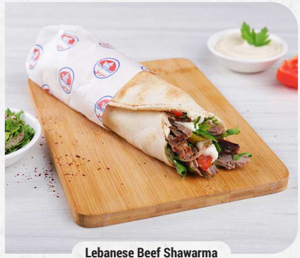
Lebanese Beef Shawarma