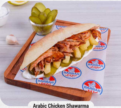
Arabic Chicken Shawarma

Beef shawarma served in homemade bread with cucumber pickles, biwaz, grilled tomato, and tarator sauce.