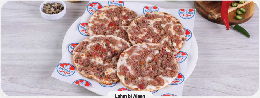
Lahm bi Ajeen

House made dough stuffed with meat, onion, and spices.