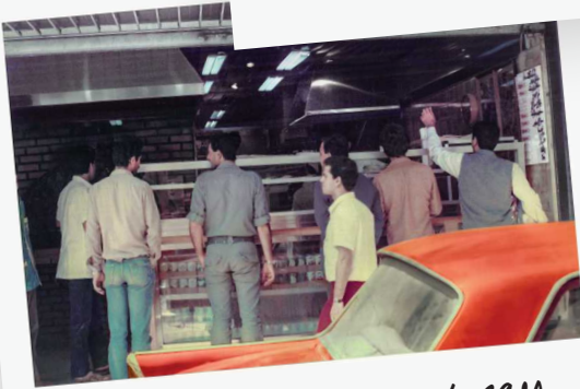
Barbar, Hamra, Beirut - 1980