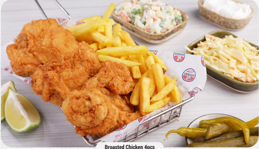
Broasted Chicken 4pcs

Fried pieces of whole chicken served with cucumber pickles, salad coleslaw, Russian salad, baked potato or French fries and toun.