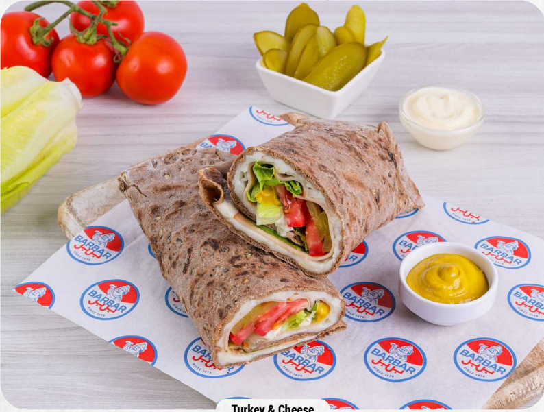
Turkey & Cheese