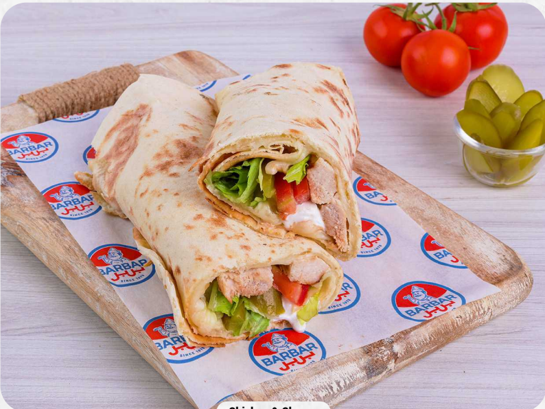
Chicken & Cheese

Turkey & cheese topped with mayonnaise, mustard, cucumber pickles, tomato and lettuce. Served in multi cereal dough.