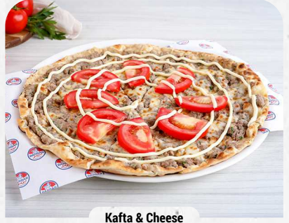
Kafta & Cheese