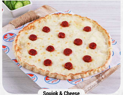
Soujok & Cheese