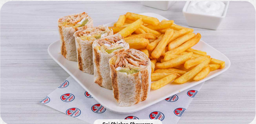
Saj Chicken Shawarma

You can choose between baked potato or french fries.