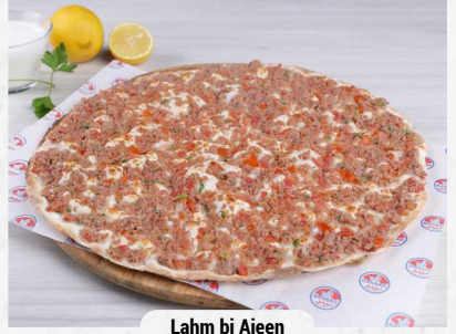
Lahm bi Ajeen