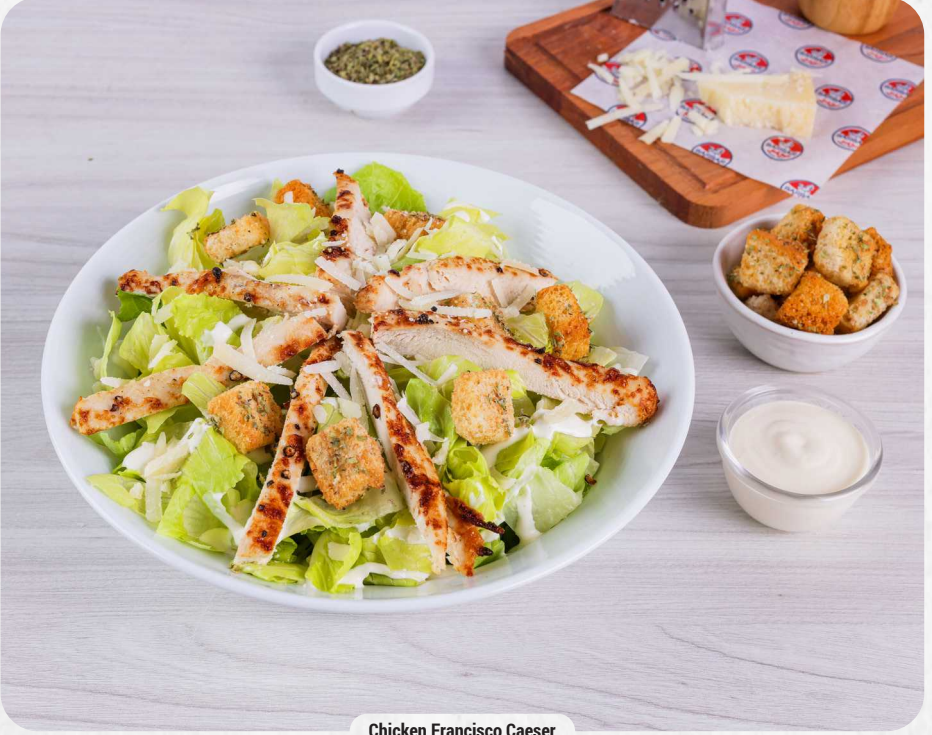
Chicken Francisco Caesar