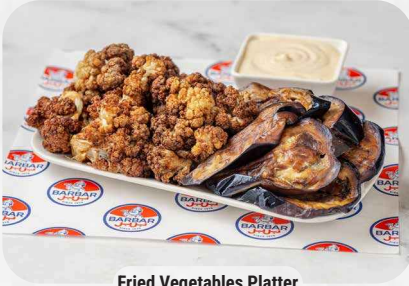
Fried Vegetables Platter