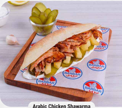
Arabic Chicken Shawarma

Beef shawarma served in homemade bread with cucumber pickles, biwaz, grilled tomato, and tarator sauce.