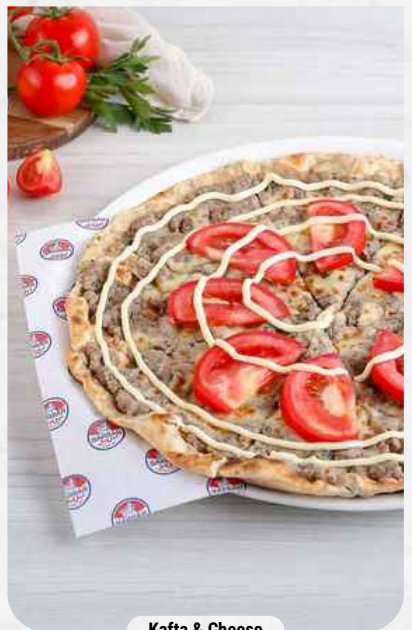
Kafta & Cheese