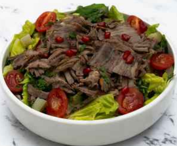
Beef Shawarma Salad

Parsley, Mint, diced tomato, onion, burghul, tabouleh dressing.