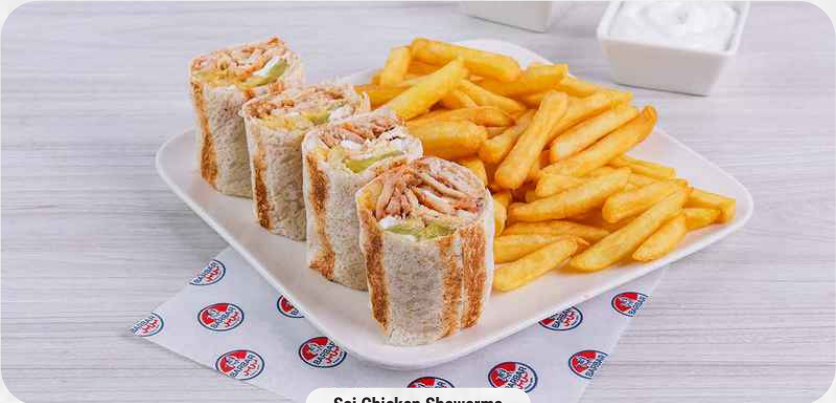
Saj Chicken Shawarma

You can choose between baked potato or french fries.