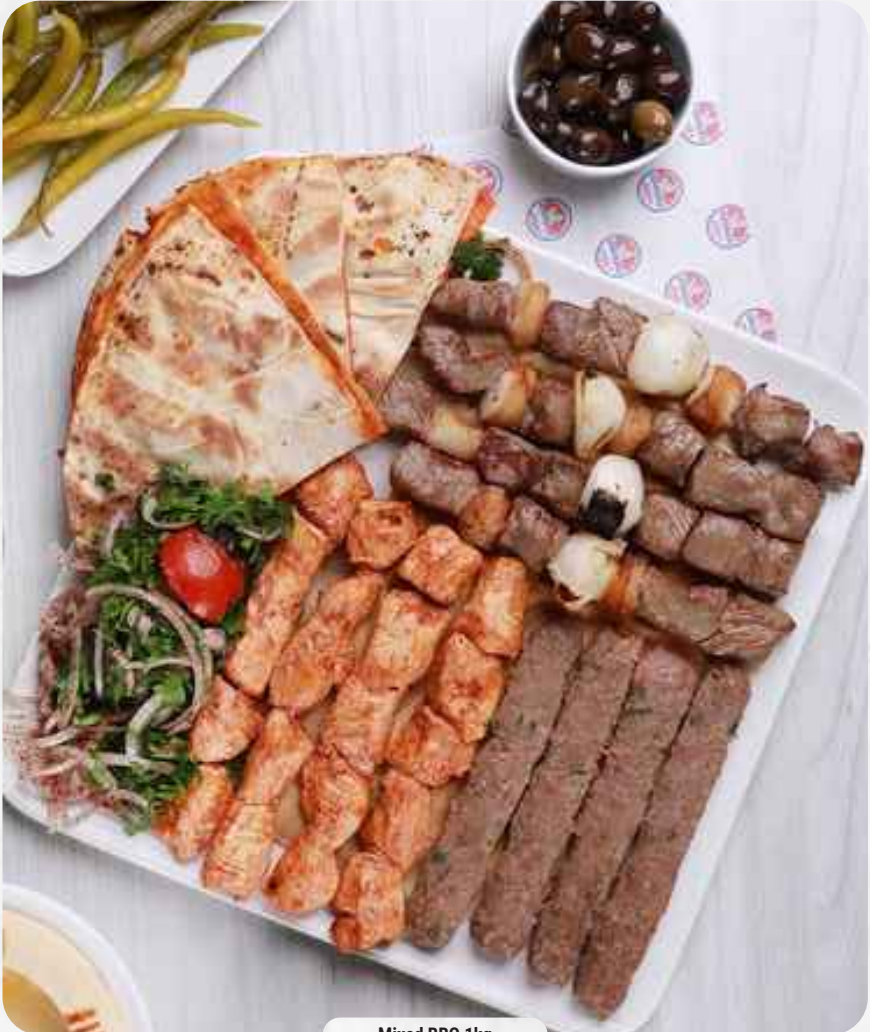
Mixed BBQ 1kg