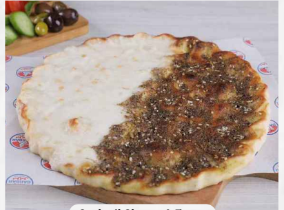
Cocktail Cheese & Zaatar