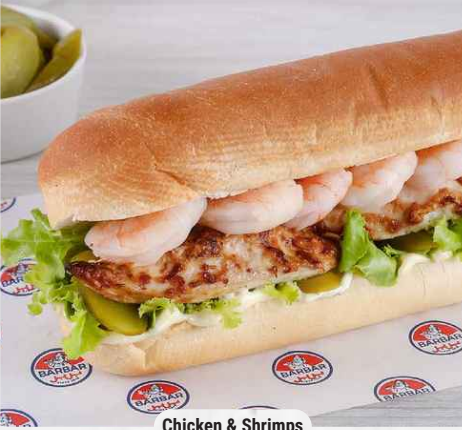
Chicken & Shrimps