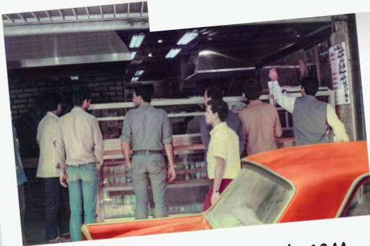
Barbar, Hamra, Beirut - 1980