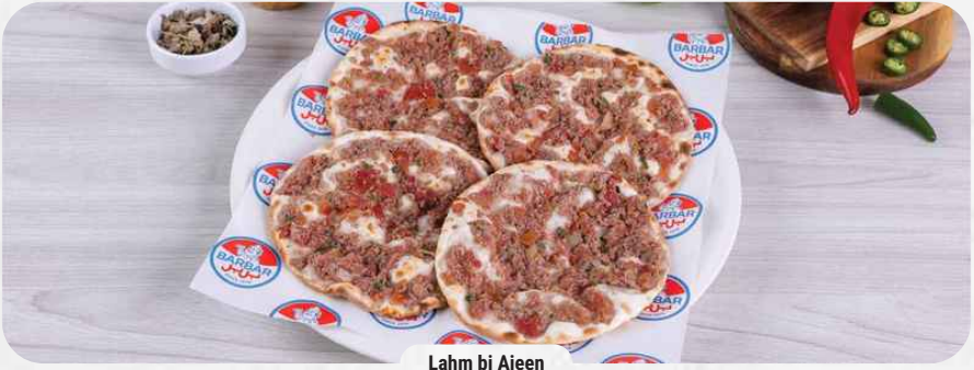
Lahm bi Ajeen

House made dough stuffed with meat, onion, and Spices.