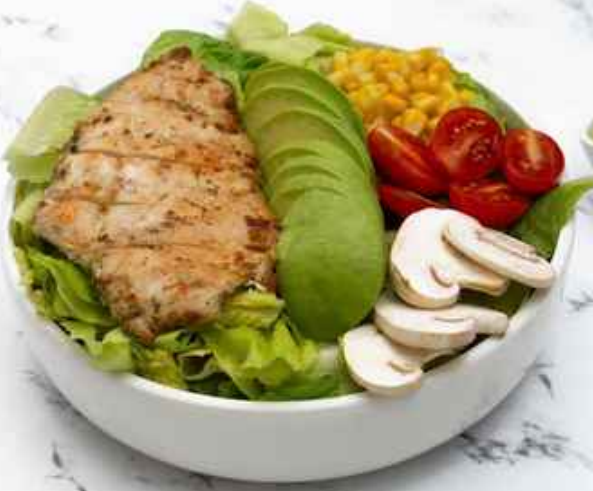
Chicken Avocado Salad