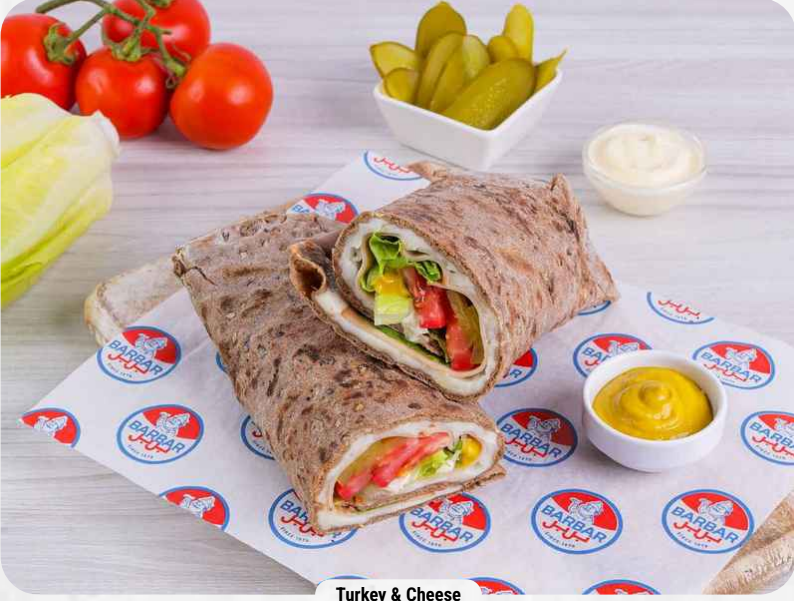
Turkey & Cheese