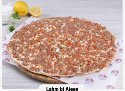
Lahm bi Ajeen