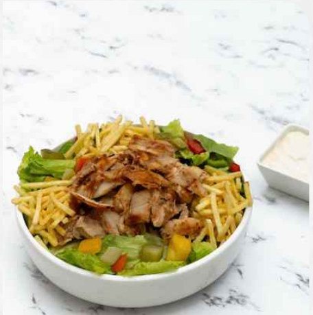
Chicken Shawarma Salad