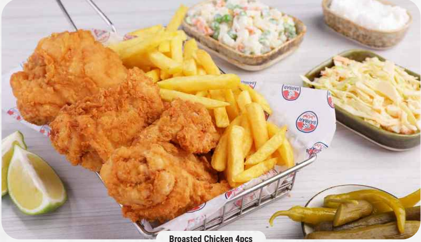
Broasted Chicken 4pcs

Fried pieces of whole chicken served with cucumber pickles, salad coleslaw, Russian salad, baked potato or French fries and toun.