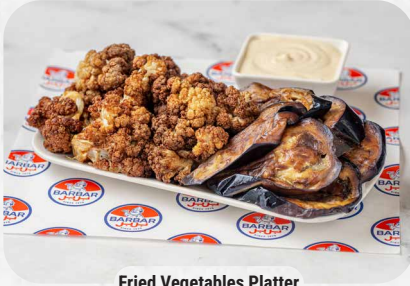
Fried Vegetables Platter