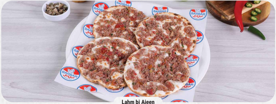
Lahm bi Ajeen

House made dough stuffed with meat, onion, and Spices.