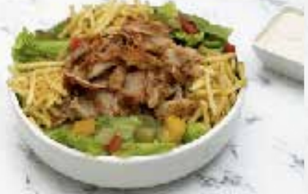
Chicken Shawarma Salad