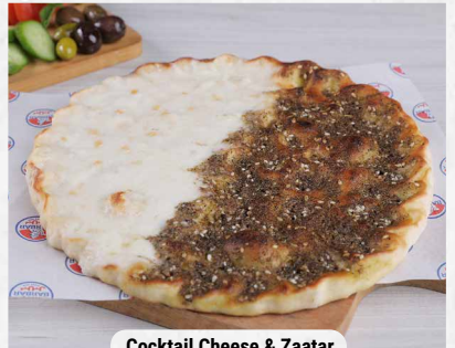
Cocktail Cheese & Zaatar