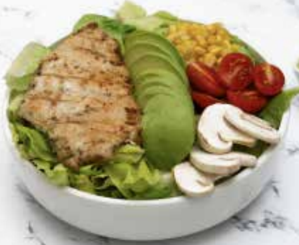
Chicken Avocado Salad