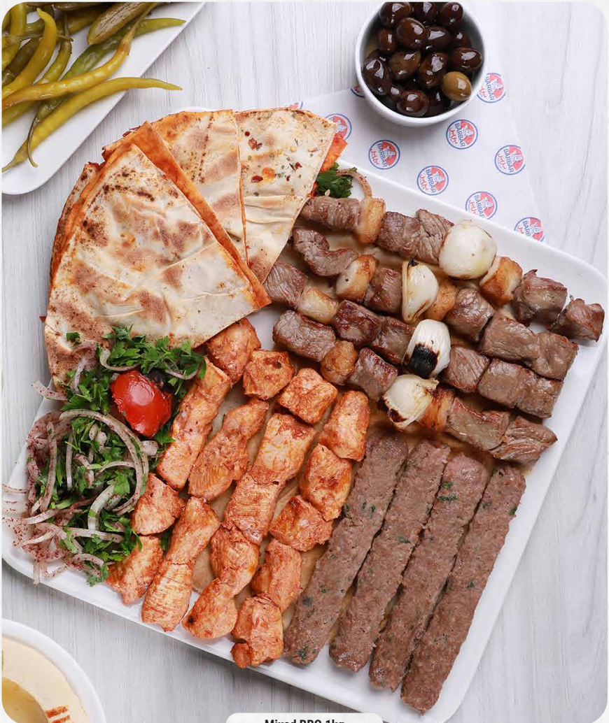
Mixed BBQ 1kg