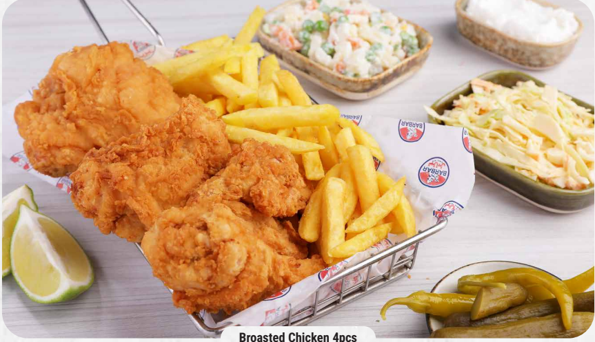
Broasted Chicken 4pcs

Fried pieces of whole chicken served with cucumber pickles, salad coleslaw, Russian salad, baked potato or French fries and toum.