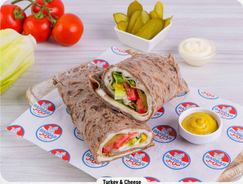
Turkey & Cheese