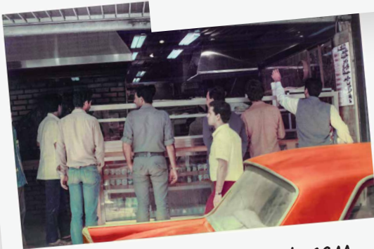
Barbar, Hamra, Beirut - 1980