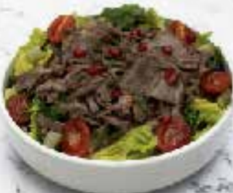
Beef Shawarma Salad

Parsley, Mint, diced tomato, onion, burghul, tabouleh dressing.