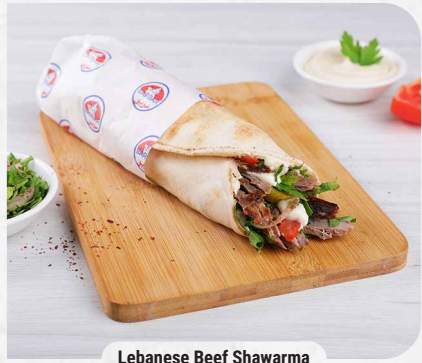
Lebanese Beef Shawarma