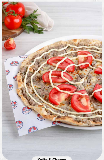
Kafta & Cheese