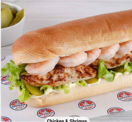
Chicken & Shrimps