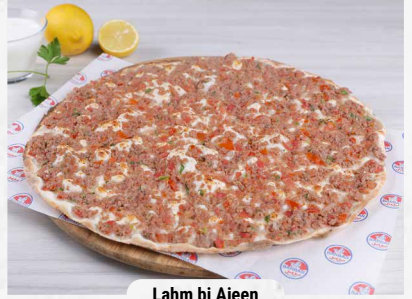
Lahm bi Ajeen